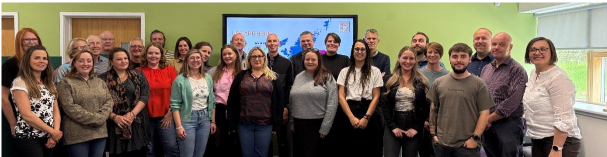
ALIenergy team members join a Home Energy Scotland advice centre meeting

ALIenergy and Home Energy Scotland each collect data on the impact of their work. There are plans to extend this to include the estimated social return on investment to gather more information about health and wellbeing benefits to complement traditional quantitative measures such as numbers of people advised, client gain and measures installed. ALIenergy secured an Energy Redress Scheme grant of £23,000 in October 2025 that will support the early stages of this work.